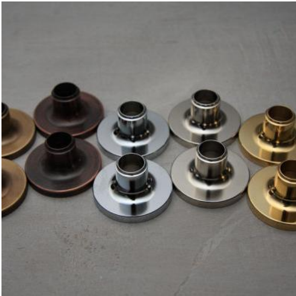
15 & 22mm Pipe Shrouds available in 6 stunning finishes - £34 + VAT per pair