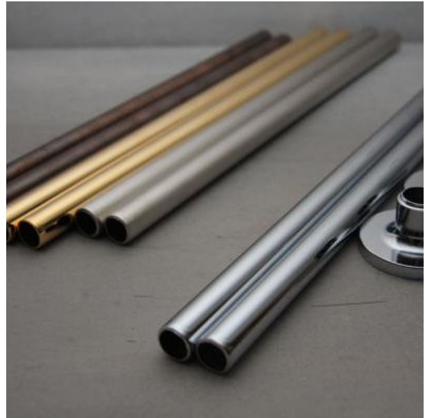
Matching plated pipes to compliment the pipe shrouds. 300mm long - one pipe can be cut in half for both ends - £11 + vat.